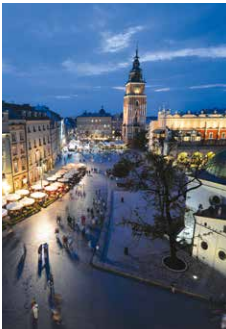
The Main Market Square – the largest medieval square in Europe

A rich educational experience providing the basis for a holistic approach to modern medical challenges