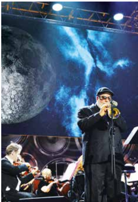
Randy Brecker in concert