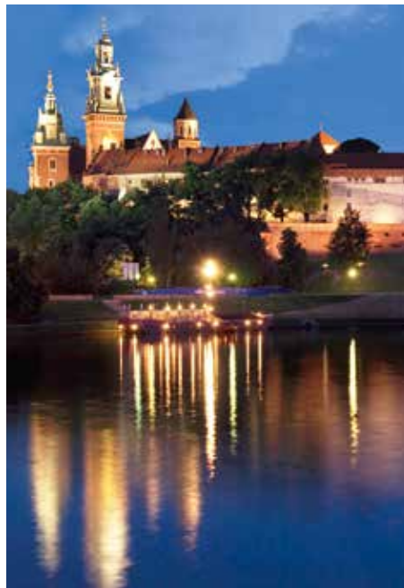
The Gothic Wawel Royal Castle overlooking the Vistula River

Information- -packed lectures delivered by world- -renowned experts